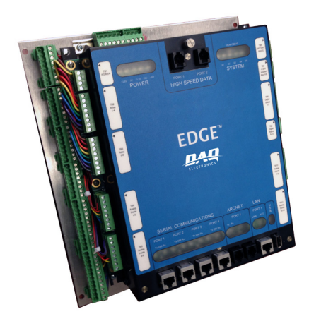
Shown mounted to an EDGE remote, the EDGE Conversion Panel provides an easy upgrade path for users of Polaris and Elara III units.

The EDGE Conversion Panel enables current users of Polaris or Elara III equipment to easily upgrade to the advanced EDGE remote, the latest generation of DAQ Callisto technology. Eliminating the need for time consuming re-wiring, the panel provides a wiring harness that matches the connection locations of existing modules. The disconnection of Polaris or Elara III units and their replacement with EDGE RTUs becomes a simplified unplug/re-plug process.